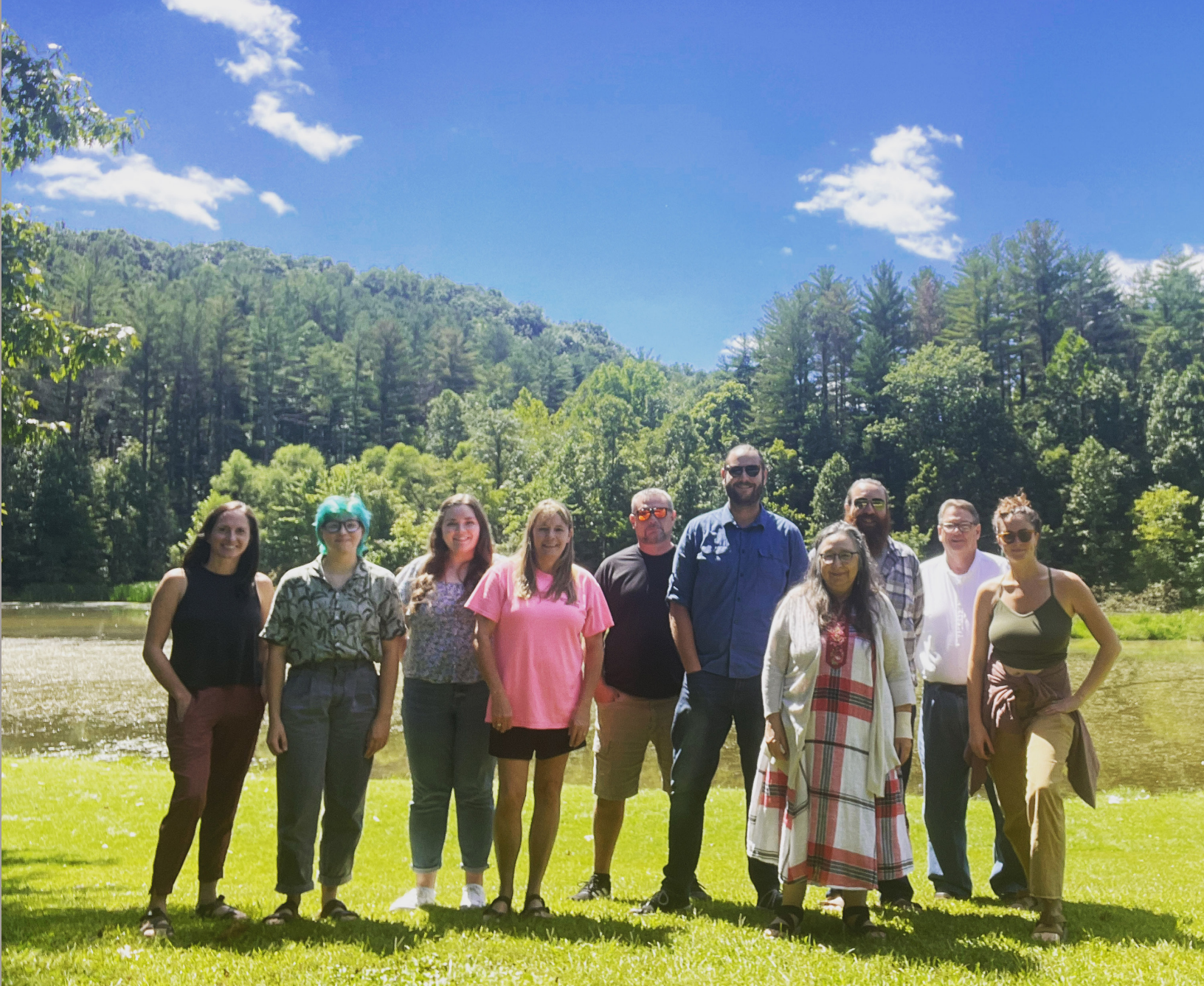
Staff Photo from 2022.